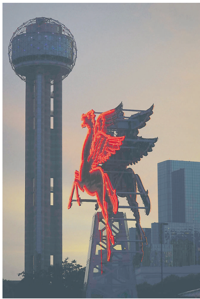
Una masa de aire seco y polvoriento que se forma sobre el desierto del Sahara a finales de la primavera, ocasionalmente llega a Texas.